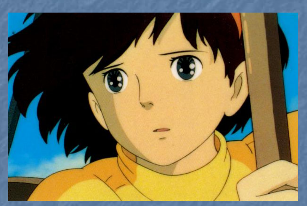
Shorter hair is more mature than pigtails