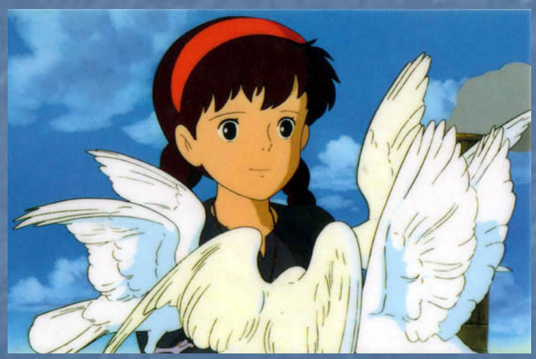
Sheeta From Laputa: Castle in the Sky