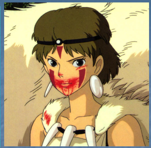
San From Princess Mononoke