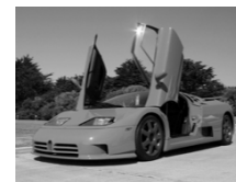
Someone who died in 1930 could still drive a car today because they've kept the same Abstraction! (right pedal faster, left pedal slow)