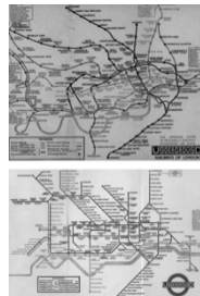
The London Underground 1928 Map & the 1933 map by Harry Beck.