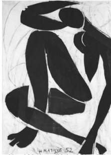
Henri Matisse "Naked Blue IV" © 2011