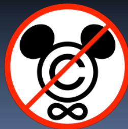
Logo for opposition to CTEA