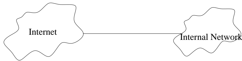
Figure 1: An example network topology, with a single link connecting the internal and external networks. We'll tackle these each on their own.