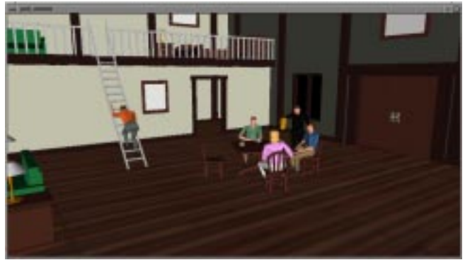
Figure 4: Jack's MOOse Lodge: a scene from the example.

The scene (Fig. 4) is the inside of a mountain lodge built from wood. There is a big room with a dining area containing a table and four chairs. To one side of the dining area is a loft with a ladder leading to it. The loft is surrounded by railings and has a bed on it. Below the loft is an open doorway leading to a kitchen. The main entrance of the lodge has a door with a knob. The test scenario includes five virtual humans: four are user-instructed "smart" avatars and one