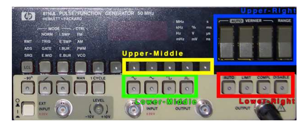
Figure 3: HP 8116A Front Panel