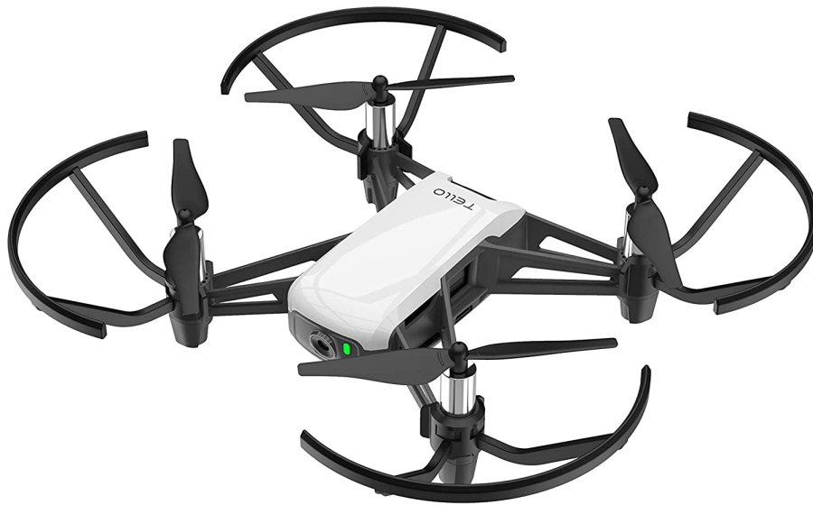
Figure 1: DJI Tello quadrotor.

The goal of this week's lab is to apply our newly gained control knowledge to hardware. Specifically, you will design a yaw controller for the DJI Tello quadrotor as depicted in Figure 1. To do so, you will need to first identify a model to represent the system. Unfortunately, DJI does not disclose its proprietary information about the model nor the controller it uses. Hence, this lab approaches the Tello as a black box. In this lab, you will probe the yaw command input at different frequencies to determine the frequency response of the yaw dynamics of the system. That information will then be used to design a controller to track a reference yaw angle. This controller will be tested and compared with DJI's controller to reject disturbances and track reference signals.