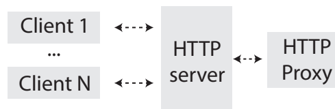
Figure 1: when using a proxy, the http server serves requests by streaming them to a remote http server (proxy). responses from the proxy are sent back to clients.

The httpserver will be in either file mode or proxy mode. It does not do both things at the same time.