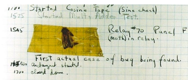
Grace Hopper's Notebook, 1947, Moth found in a Mark II Computer