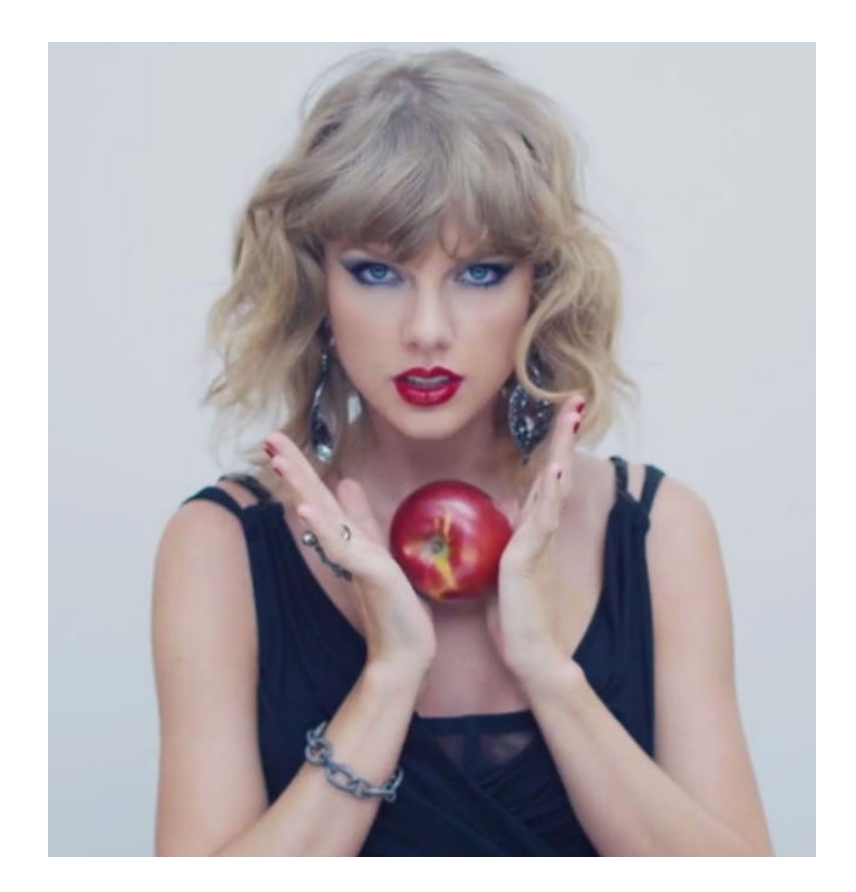
Figure 1: This Space Deliberately Left Blank