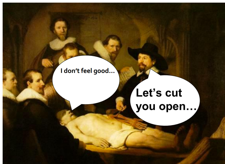
Figure 1: Rembrandt, "The Anatomy Lesson of Dr. Nicolaes Tulp," 1632 (with modifications). 1

If this were the 17th century, medical imaging would be something like this: